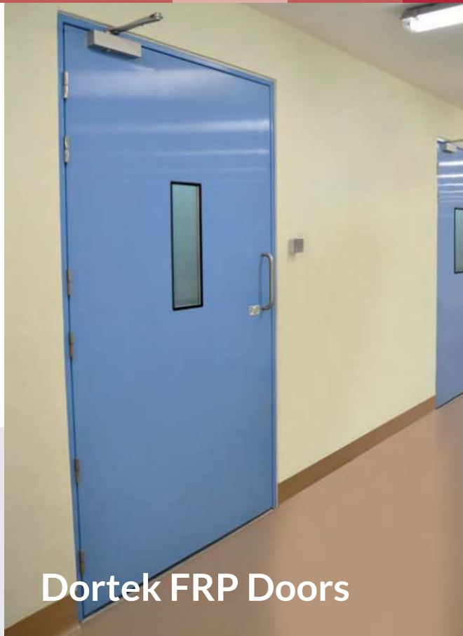
DorteK FRP Doors