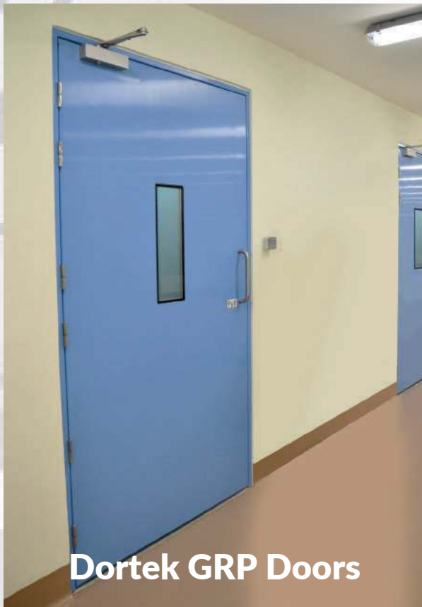
DorteK GRP Doors