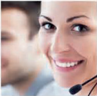
Service & Maintenance