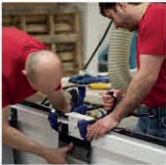
Installation & Commissioning