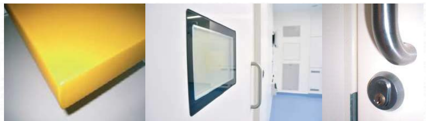
Seamless FRP Door Panel