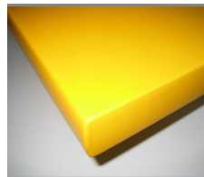
Seamless Fiberglass Door Panels