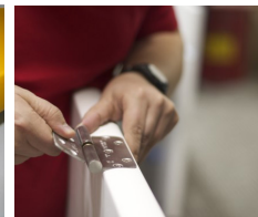
Factory installed Hardware