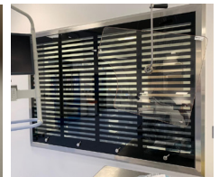
Flush Vision Panels