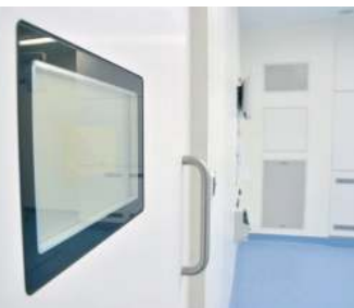
Optional Flush Vision Panel