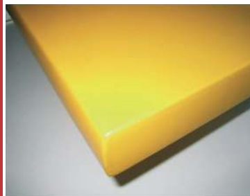
Seamless Fiberglass Door Panel