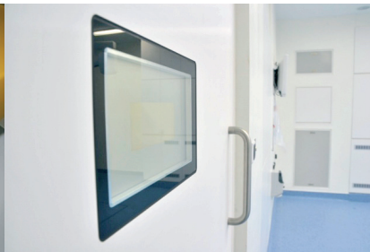
Optional Flush Vision Panel