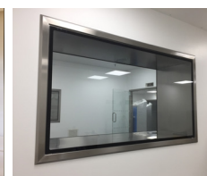
Standard Flush Glazing