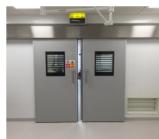
Bi Parting Door