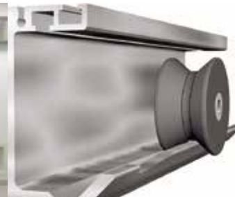
Patented Track System