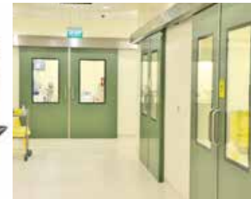
Optional Flush Vision Panels

Dortek Inc 10 East 6th Avenue Suite 310 Conshohocken Pennsylvania 19428 Tel: +1 617 401 8226 Email: us-sales@dortek.com