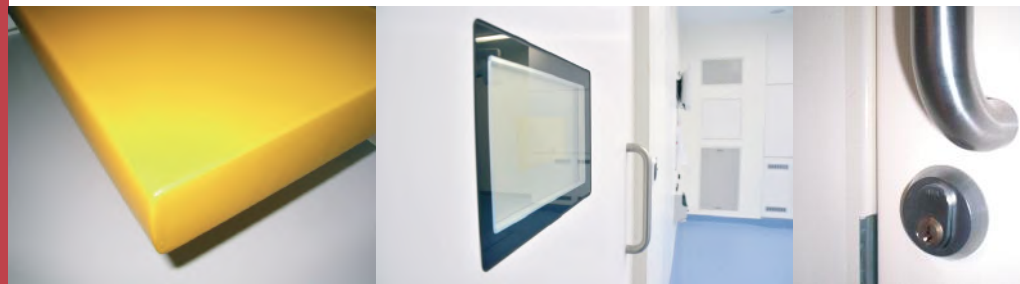
Seamless Fiberglass Door Panel