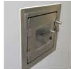
• Transfer and Trolley Hatches

Acoustic Doors Coldstore Doors Fire Doors FRP Doors Glass Doors GRP Doors Hermetic Doors Hygienic Doors Rapid Roll Doors Sliding Doors Traffic Doors Transfer Hatches Waterproof Doors Windows X-ray Doors