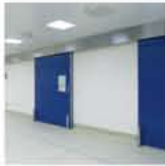
• Sliding Hygienic Doors