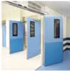
• Hinged Hygienic Doors