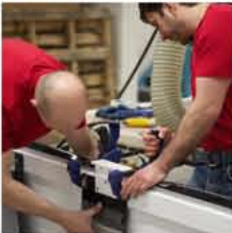
Installation & Commissioning