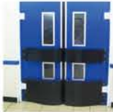
• Traffic Doors