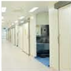
• X-ray Rated Doors