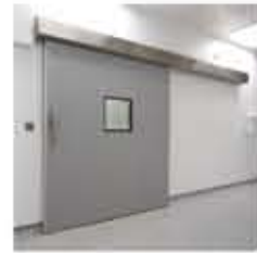
• Hermetically Sealing Doors