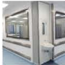
• Windows and Vision Panels