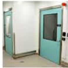
• Fire Rated Hygienic Doors