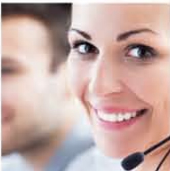
Service & Maintenance