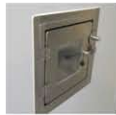
• Transfer and Trolley Hatches

Acoustic Doors Coldstore Doors Fire Doors FRP Doors Glass Doors GRP Doors Hermetic Doors Hygienic Doors Rapid Roll Doors Sliding Doors Traffic Doors Transfer Hatches Waterproof Doors Windows X-ray Doors