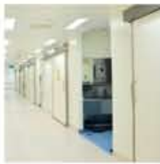
• X-ray Rated Doors