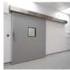
• Hermetically Sealing Doors