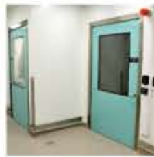
• Fire Rated Hygienic Doors