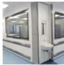
• Windows and Vision Panels