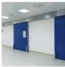
• Sliding Hygienic Doors