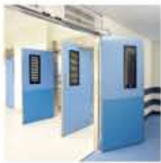
• Hinged Hygienic Doors