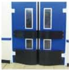
• Traffic Doors