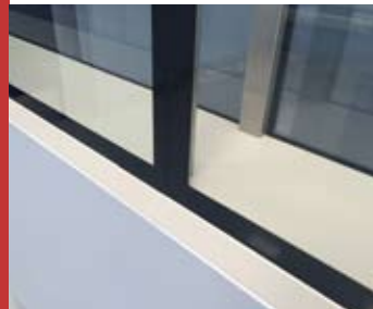
Sealed Flush Finish