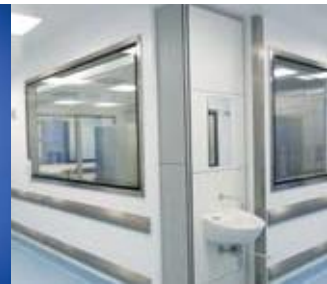
Stainless Steel Frame

Dortek Inc 10 East 6th Avenue Suite 310 Conshohocken Pennsylvania 19428 Tel: +1 617 401 8226 Email: us-sales@dortek.com