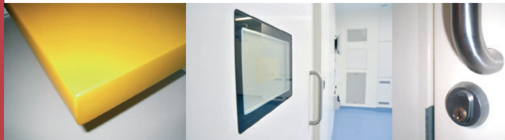
Seamless Fiberglass Door Panel