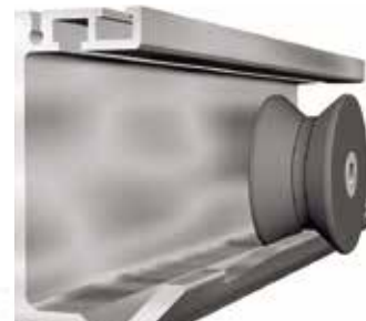
Patented Track System